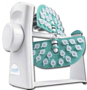
Revolver with Standard Rotisserie

With a molded housing and unique rotisserie design, the Revolver is easy to clean and decontaminate. A 36 x 1.5/2.0 ml rotisserie is supplied with the Revolver. Other configurations are available separately.