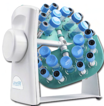
Revolver with H5600-15 Rotisserie